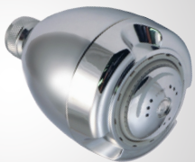
EARTH® MASSAGE SHOWERHEAD 1.5 GPM