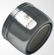
AERATOR 1.5 GPM