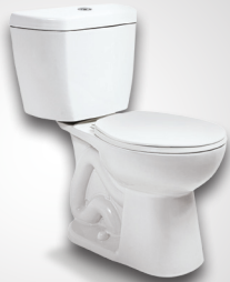
STEALTH® 0.8 GPF